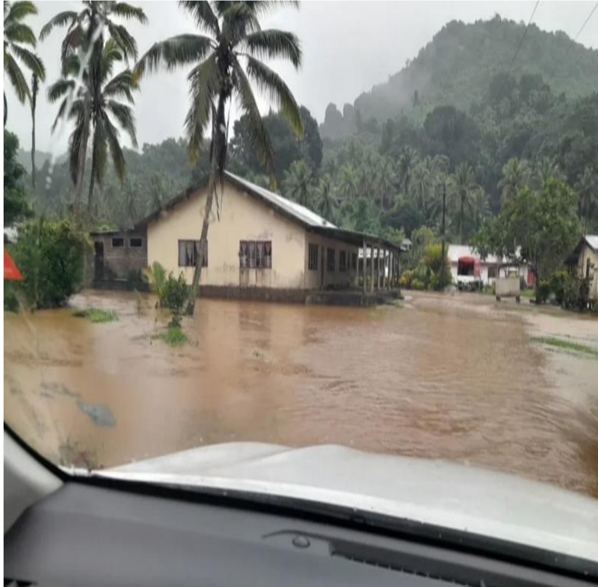
Flooding in Nakorovou, in the Central Division on 15 th May, 2024.

Source: National Disaster Management Office, Fiji