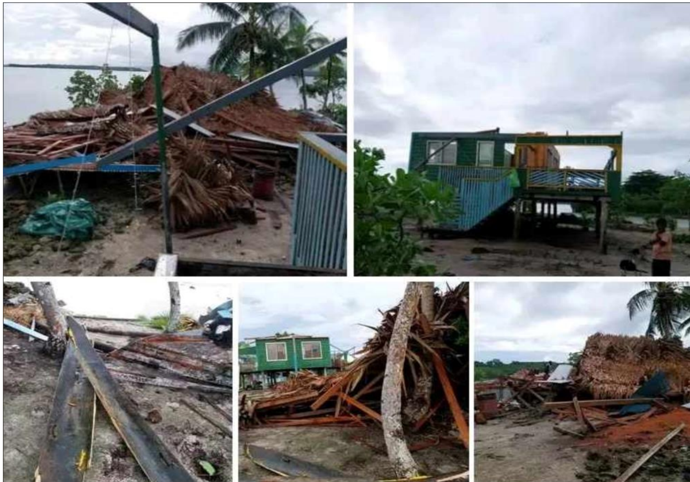
Strong wind destroy a family house in one of the Islands in Western Province. Date: September 2024