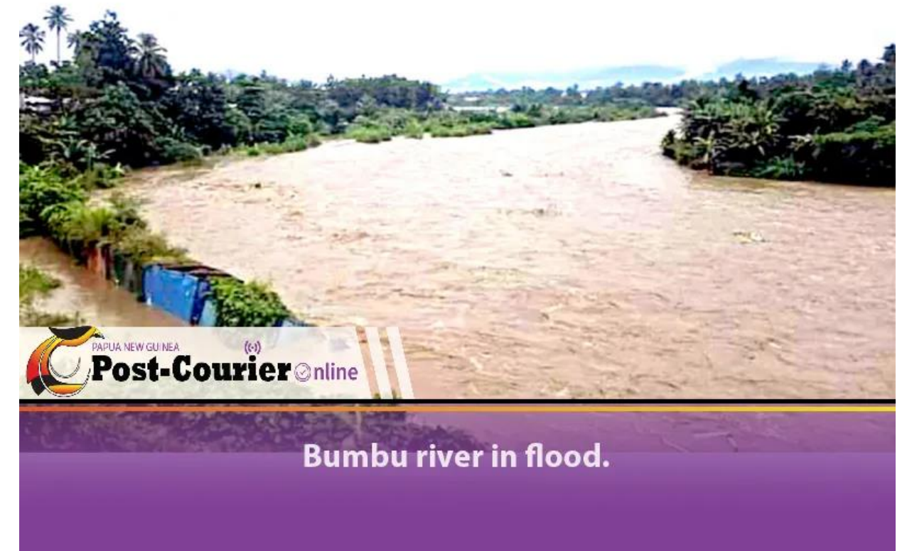
Extent of the Bumbu River flooding