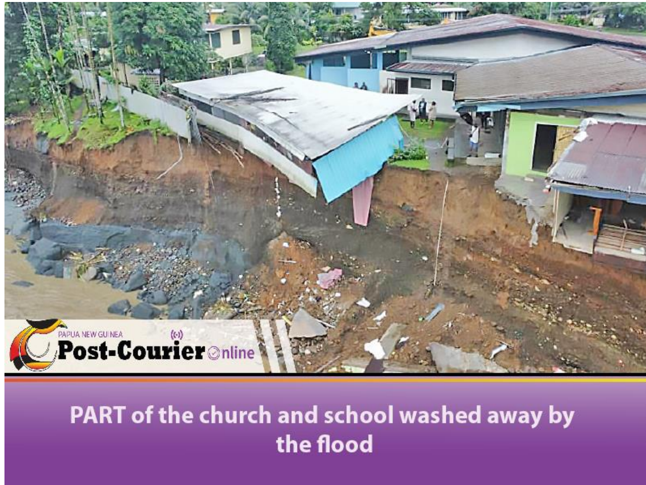
Flooding from Bumbu River in Lae, Morobe Province washed away part of a classroom for Emmanuel Elementary School.