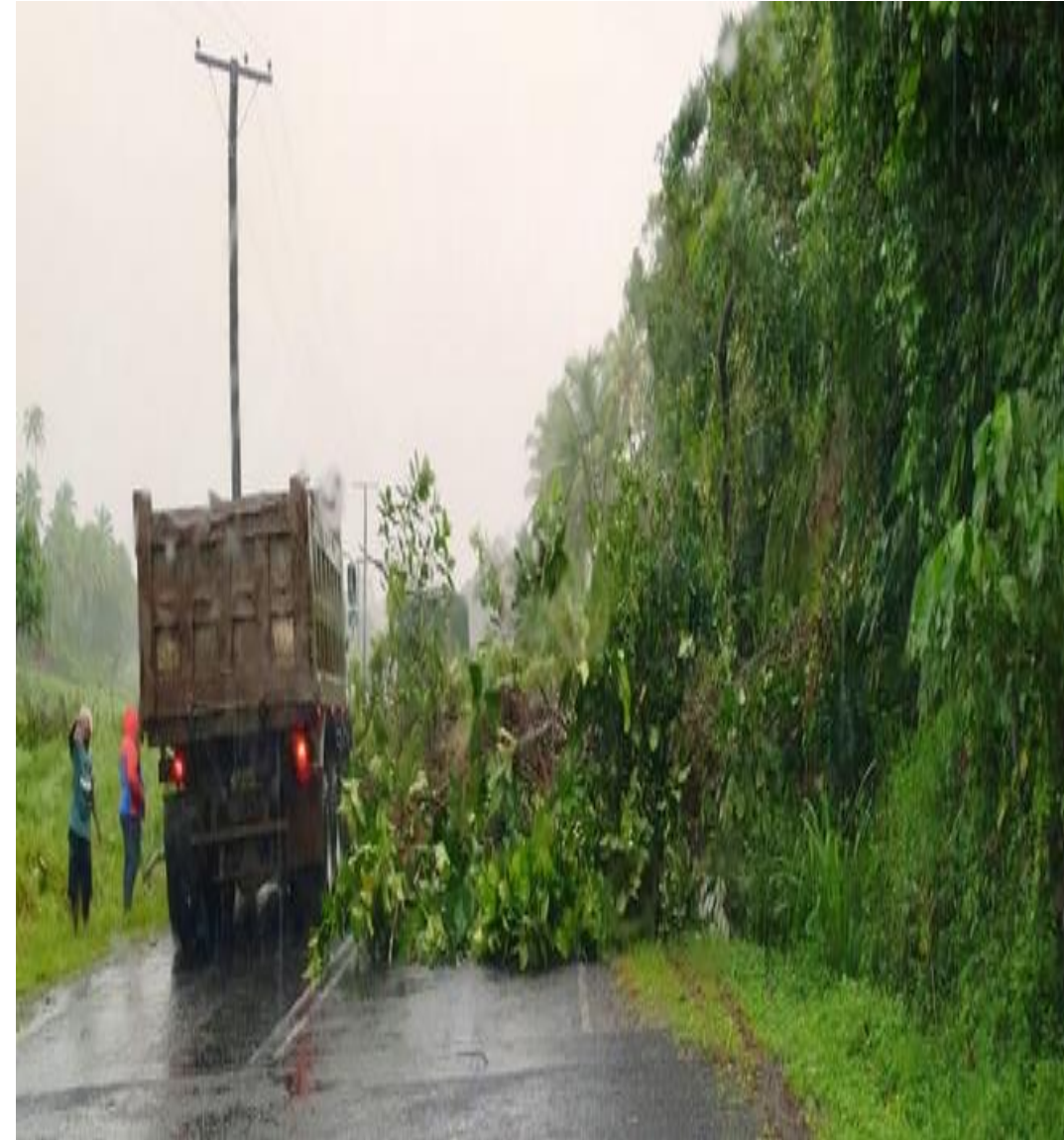
Landslide at Talenaua, Serua in the Central Division on 15 th May, 2024.