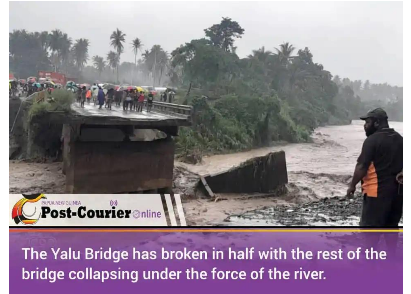
Extent of the damage to the Yalu Bridge