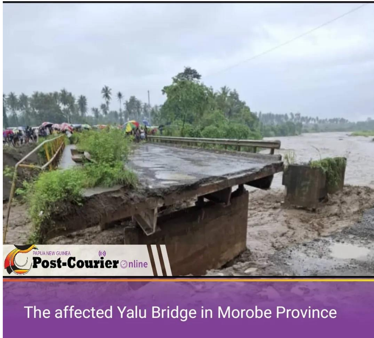
The remnant of the Yalu Bridge.