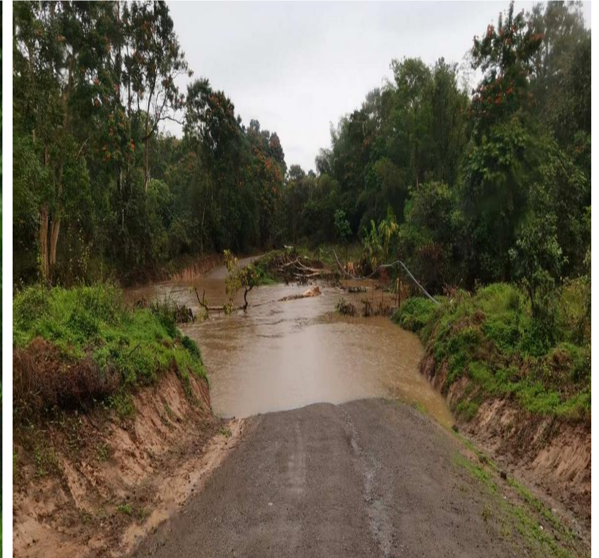
Flash flooding in Waidradra, in the Central Division on 26 th August, 2024.